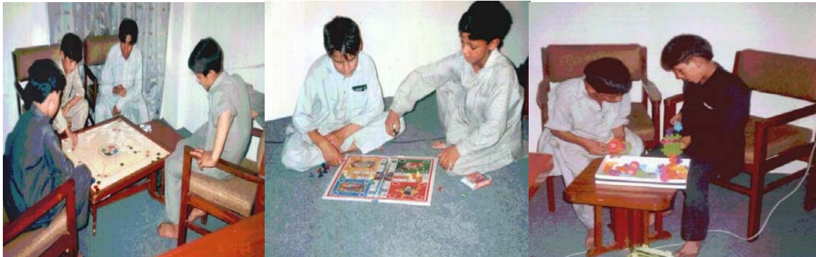
Recreational Activities: Children are busy in some indoor recreational activities at the Child Friendly Centre Gilgit

The Child Friendly Centre Gilgit is committed to providing programs that offer children opportunities to socialize, learn and play together in a caring environment. While in the Centre, children are allowed to participate in recreational activities and games. Indoor games are chosen by the children themselves. In addition children are provided opportunities to watch their favorite cartoons and movies and to listen songs by their own choice. Children's participation in arts, crafts, and recreational activities provide them an opportunity to socialize with peers and to increase their awareness about team work, and how to resolve conflicts peacefully and respect others' opinions.